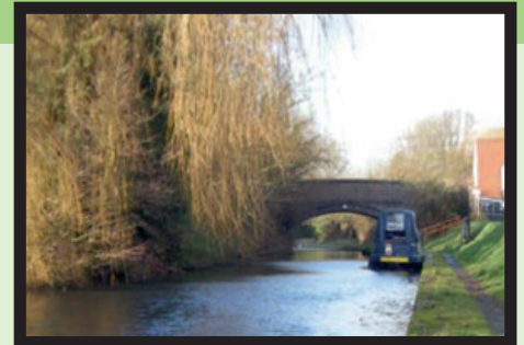
Grand Union Canal in Catherine-de-Barnes