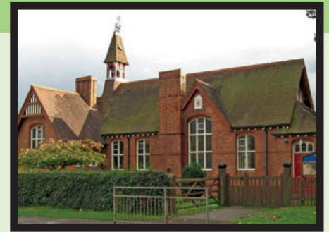
The Village Hall, Catherine-de-Barnes