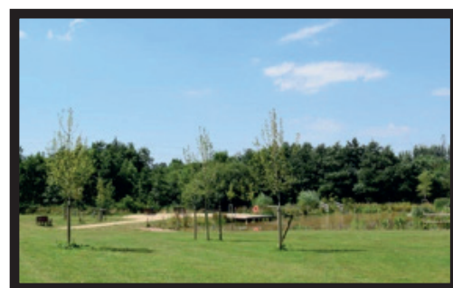
The Wildlife Pond by the Spinney